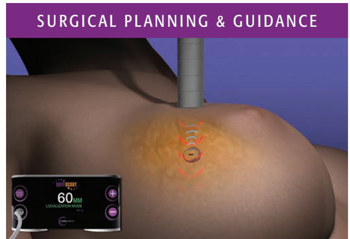
The SCOUT system uses a unique radar signal to precisely guide the surgeon to the tumor with \pm 1 mm of accuracy.