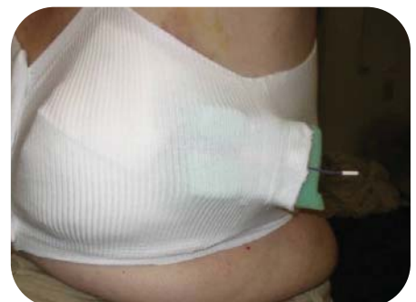
Figure 3 Sterile dressings and surgical bra applied

Conclusion: The multiple, peripheral source lumens of the SAVI applicator allowed for significant dose modulation at the thinnest skin spacing (max skin dose <100%) while maintaining excellent target volume coverage. Sculpting of the 3-D dose delivered is easily accomplished with the SAVI device.